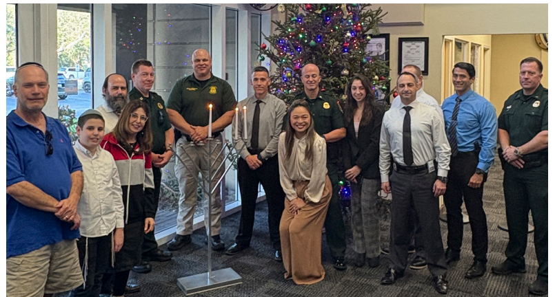
Menorah Lighting at Sarasota Sheriff Headquarter