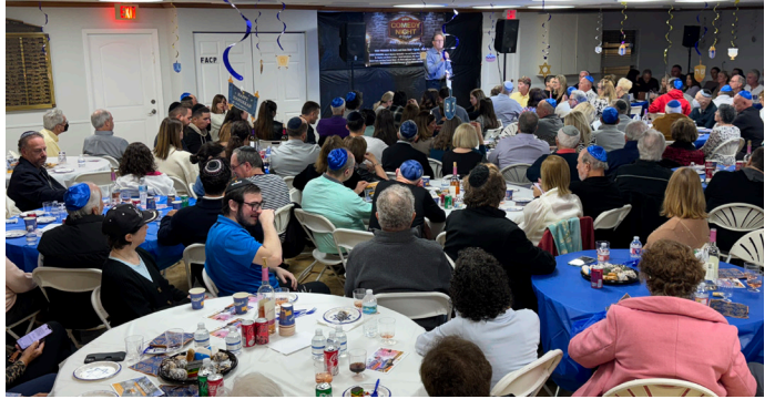
Comedy Night at Chabad