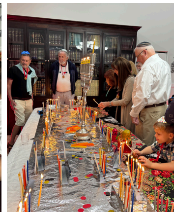
Russian Style Chanukah Celebration